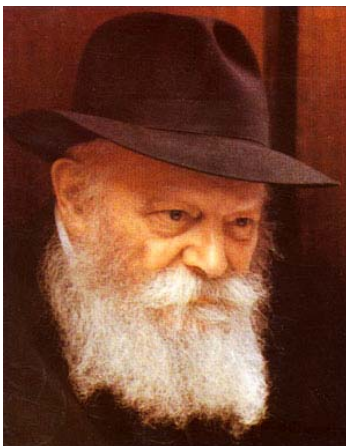
The Lubavitch Rebbe